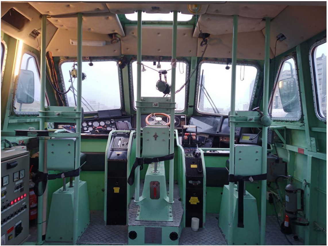
© Damen Trading & Chartering (DT&C). Unauthorized use and/or duplication of this material without express and written permission from DT&C is strictly prohibited. Excerpts and links may be used, provided that full and clear credit is given to DT&C with appropriate and specific direction to the original content.