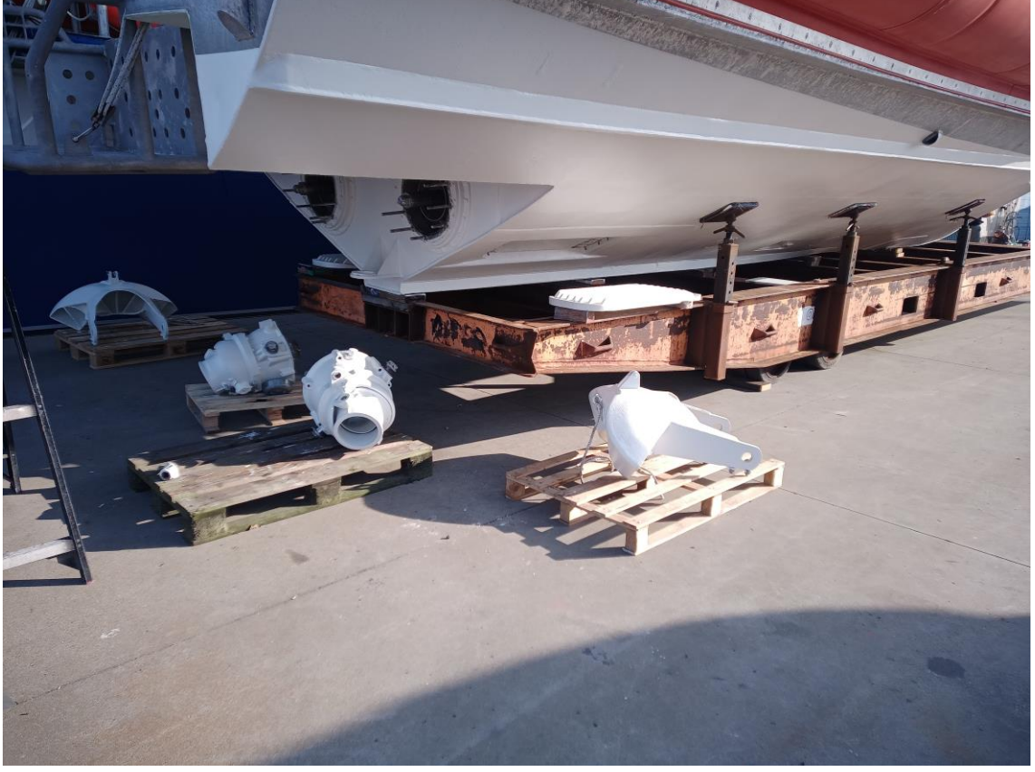
© Damen Trading & Chartering (DT&C). Unauthorized use and/or duplication of this material without express and written permission from DT&C is strictly prohibited. Excerpts and links may be used, provided that full and clear credit is given to DT&C with appropriate and specific direction to the original content.