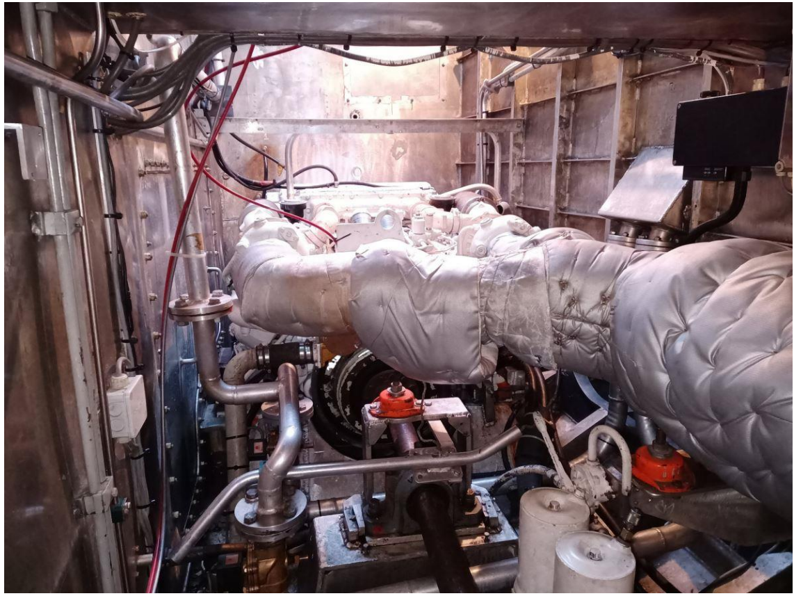
© Damen Trading & Chartering (DT&C). Unauthorized use and/or duplication of this material without express and written permission from DT&C is strictly prohibited. Excerpts and links may be used, provided that full and clear credit is given to DT&C with appropriate and specific direction to the original content.