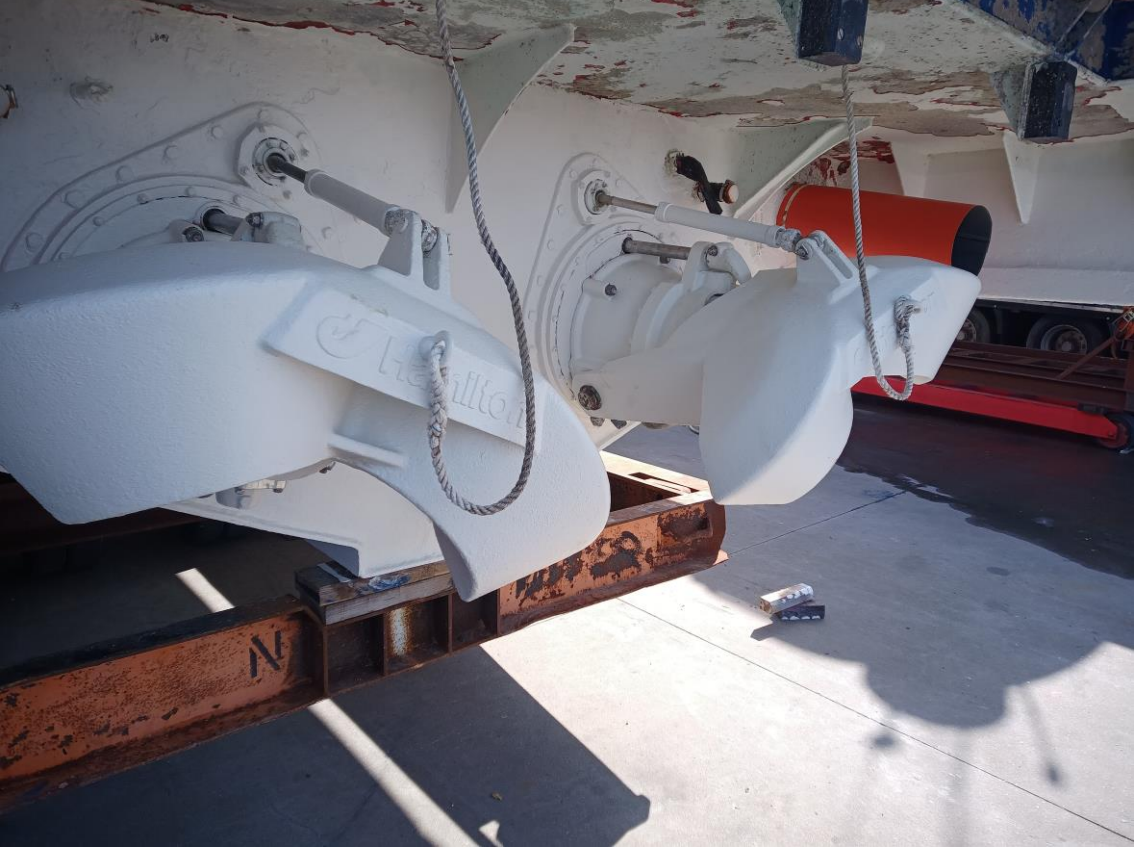
© Damen Trading & Chartering (DT&C). Unauthorized use and/or duplication of this material without express and written permission from DT&C is strictly prohibited. Excerpts and links may be used, provided that full and clear credit is given to DT&C with appropriate and specific direction to the original content.