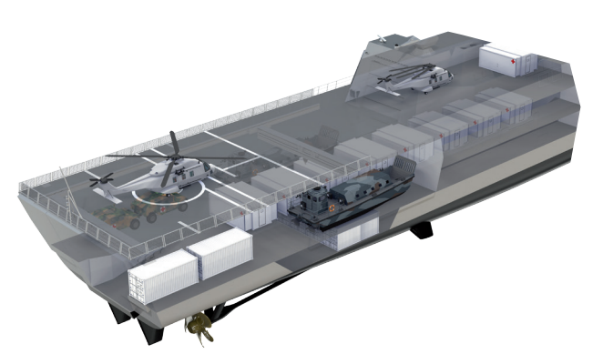
HUMANITARIAN AID & DISASTER RELIEF (HADR)